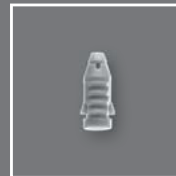
Actual Size: 2.8mm

Stop by booth #103-104 to try the NEW 2.8mm PopLok™ Knotless Anchor