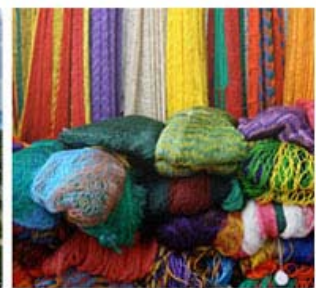
EXHIBIT AND SPONSORSHIP OPPORTUNITIES